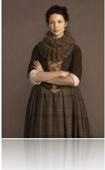
She plays Claire Beauchamp