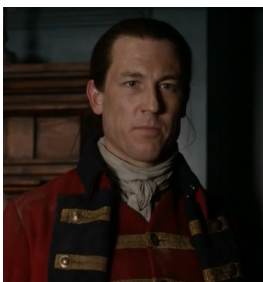
He plays Frank Randall and Jonathan Randall (he's the bad guy).

Not for the faint-hearted !! Some scenes can be shocking.